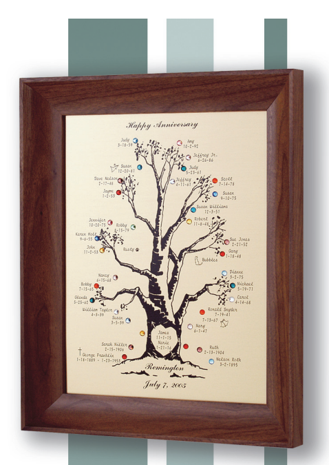
Family Birthstone Tree - Rectangle

A sensitive way to handle this is to have one parent in the heart. When parents have been divorced and remarried it is possible to have more than one spouse on the Tree . This is common