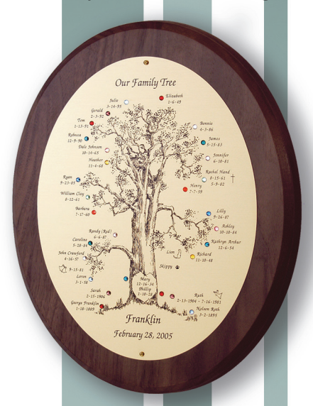
Family Birthstone Tree - Oval